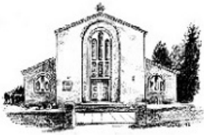
St Mary's Belle Vue Road