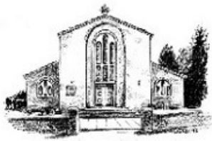
St Mary's Belle Vue Road