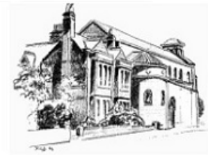
St Joseph's Queens Road